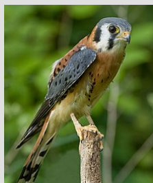
Left to right clockwise: yellow-breasted chat, American kestrel, box turtle and black racer snake.