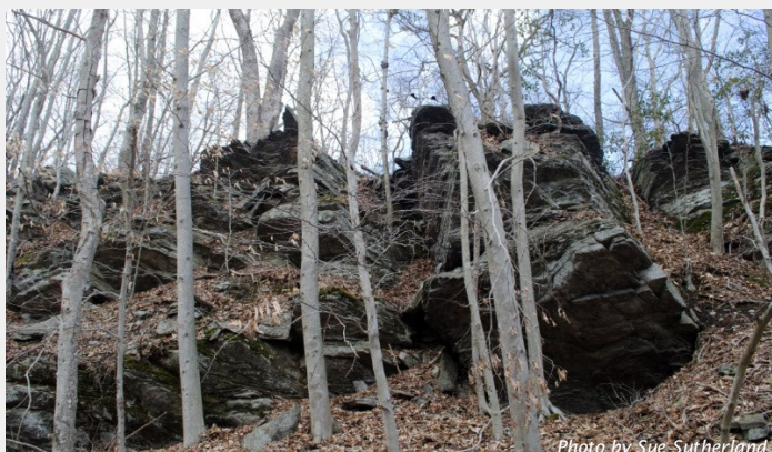
Avery Farm west ledge

For hikers, walkers, and artists, Avery Farm features scenic views from the road of bucolic pastures; in addition, several trails and