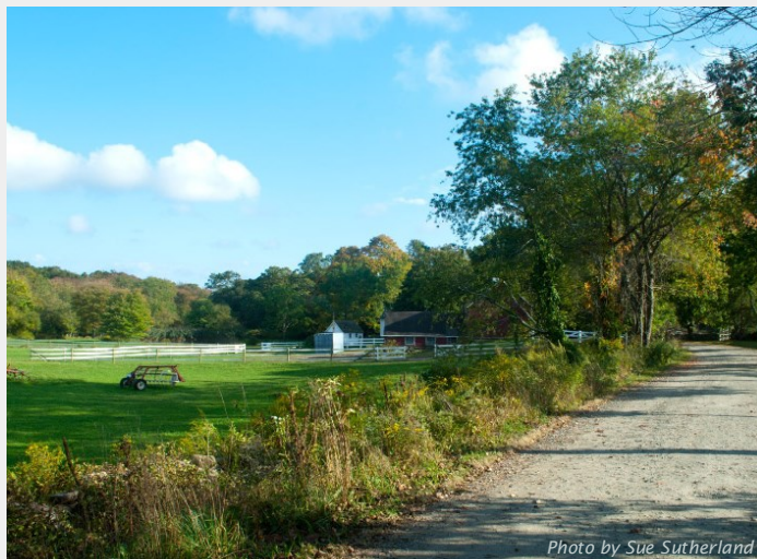
Colonial Avery Farm

Protecting the Avery Farm is critical because of the property's size, location, and historical and ecological significance. Latham Avery, a pioneer in land conservation, purchased the first 80 acres in 1929 and enlarged it over time through the acquisition of over 200 additional acres. The result is almost 300 acres of